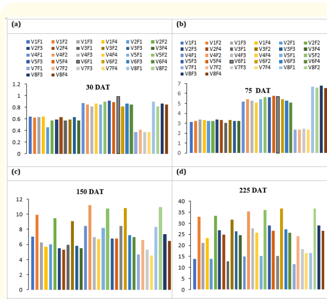
Figure 1: Effect of variety and fertilizer management on plant height of tea leaf bud cuttings at different days after transplanting (DAT).